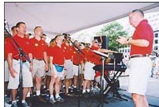
The Gay Men's Chorus performs at the Capital Pride Arts Stage in 2002